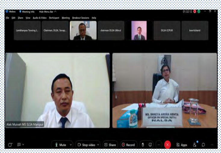
Vignette from the online training programme organised by NALSA along with Manipur SLSA