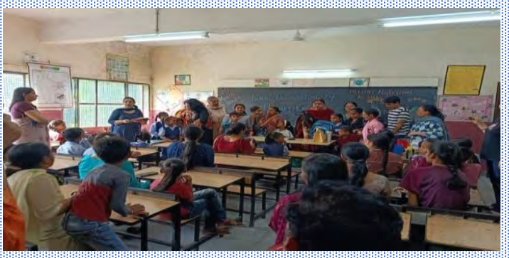
Vignettes from the programme organised by DLSA Chandigarh