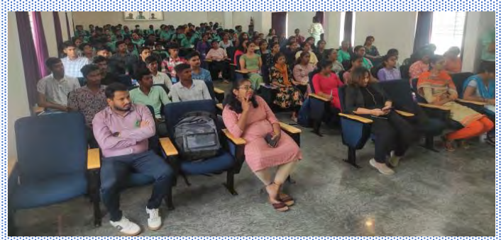
Vignettes from the programme organised by Karnataka SLSA

On 06.10.2023, DLSA, Chandigarh organized an Awareness Session on "Basic information on Drug Abuse" at Mount Carmel School, Sector 47-B, Chandigarh, where the students were told about the ill-effects of drug consumption and laws pertaining to drug abuse. The Secretary, DLSA concerned addressed the students.