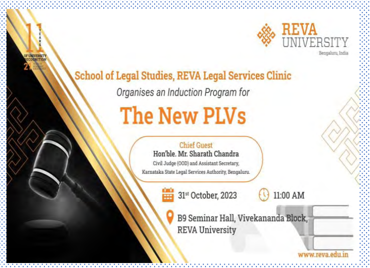
Poster of the programme organised by Karnataka SLSA