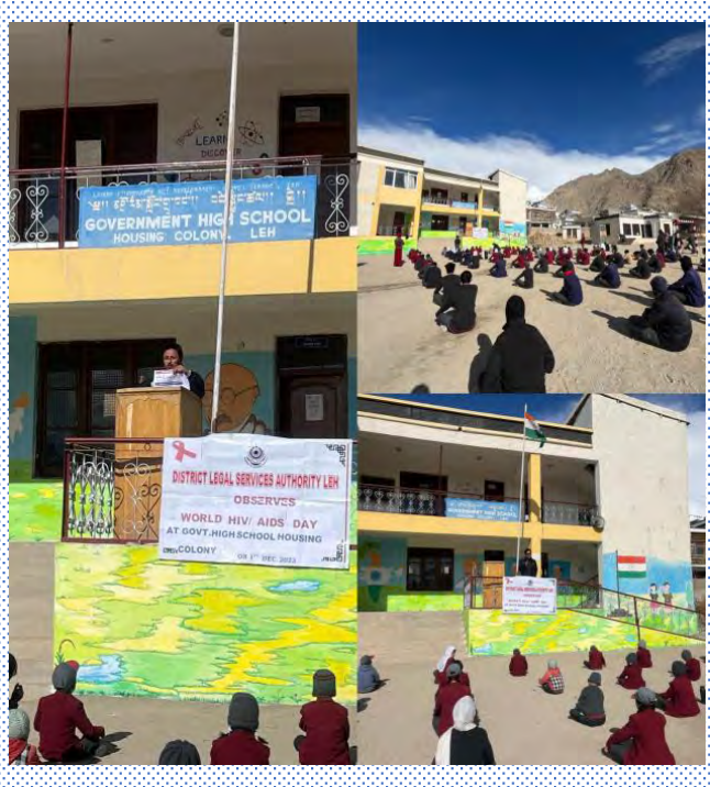
Vignettes from the programme organised by DLSA, Leh

On the occasion of World AIDS Day on 01.12.2023, the District Legal Services Authority, Leh, in collaboration with the J&K State AIDS Control Society (SACS), organised a program at Government High School Housing Colony, Leh, to spread awareness about the pivotal role communities play in combating HIV/AIDS and highlighting the legal framework outlined in the AIDS (Prevention & Control) Act 2017, particularly advocating for the rights of HIV-affected persons. An Assistant Legal Aid Defence Counsel was the Speaker for the day, who highlighted the role of DLSAs in reaching out to the emphasized common masses. He upon importance of Para Legal Volunteers as frontline workers for amplifying the message. His words echoed the importance of community-led initiatives eradicating stigma and discrimination. program was attended by Teachers, Students and PLVs.