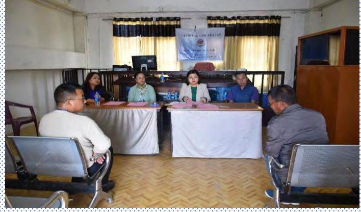
Vignette from Mizoram