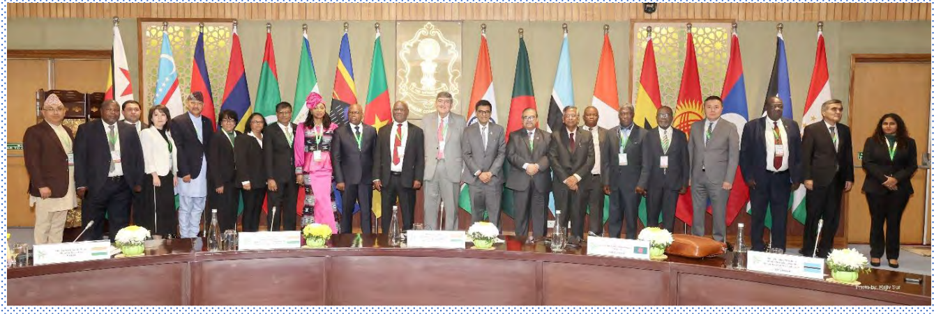
Vignettes from 1st Regional Conference on Access to Legal Aid organised at Supreme Court of India

The Inaugural session was followed by Technical Sessions on topics such as: 'Meeting the Need for Legal Aid: Status of the Realization of the Right to Legal Aid in the Global South'; 'Effective Models for, and the Benefit of Providing more Holistic, People-Centred Legal Aid Services'; and 'Strategies for Reducing Pretrial Detention, including through the Provision of Early and Effective Access to Legal Aid Services' etc. The Conference culminated into release of three outcome documents including the 'New Delhi Principles on the Role of Judiciary in Ensuring Equal Access to Justice for All in the Global South', which was signed by the Chief Justices and Judges of 16 Countries. The Hon'ble President Smt. Droupadi Murmu, graced the Valedictory Ceremony of the Regional Conference and addressed the august gathering.