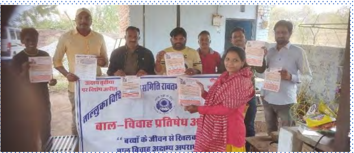
Vignettes from the programme organised by DLSAs in Rajasthan

To counter the regressive social practise of solemnizing child marriages on the occasion of DevUthani Ekadashi. Rajasthan SLSA directed all DLSAs to organize Legal Literacy and Awareness Camps, focusing on ill effects of Child Marriage and its legal implications on daily basis from 01.11.2023 to 23.11.2023. After identifying the child- marriage prone areas, frequent programmes were organized in such areas, wherein services of Panel Lawyers, PLVs, Social Workers etc. were taken to spread awareness amongst the masses about the serious consequences of child marriage; the deterrent provisions of the Prohibition of Child Marriage Act, 2006 etc.