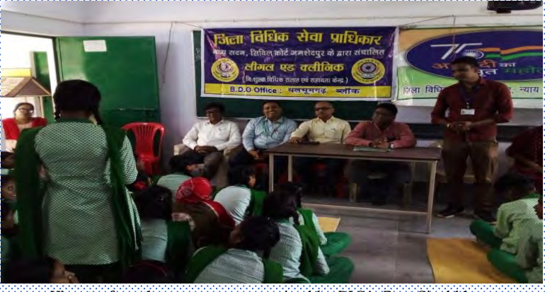
Vignette from the programme organised by DLSA, East Singhbhum, Jharkhand

On 26.10.2023, DLSA, East Singhbhum, Jharkhand, organised an Awareness Campaign at the Government High School, Narsingarh, Dhalbhumgarh, East Singhbhum, Jharkhand, on the topics: 'POCSO Act', 'Right to Education', 'Child Marriage' etc. A Legal Aid Counsel and Para Legal Volunteers addressed the students and teachers and responded to their queries. Around 147 persons participated in the programme.