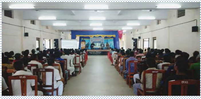
Vignettes from the programme organised by DLSA, Thiruvananthapuram, Kerala