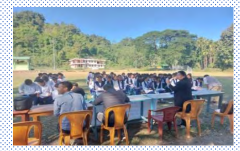
Vignettes from the programme organised by DLSA Papum Pare, Arunachal Pradesh

On 26.10.2023, DLSA, East Singhbhum, Jharkhand, organised an Awareness Campaign at the Government High School, Narsingarh, Dhalbhumgarh, East Singhbhum, Jharkhand, on the topics: 'POCSO Act', 'Right to Education', 'Child Marriage' etc. A Legal Aid Counsel and Para Legal Volunteers addressed the students and teachers and responded to their queries. Around 147 persons participated in the programme.