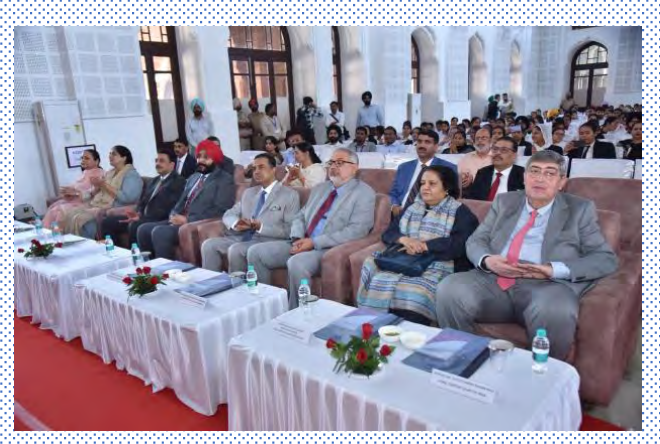
Vignettes from the programme organised by Punjab SLSA at Khalsa College, Amritsar