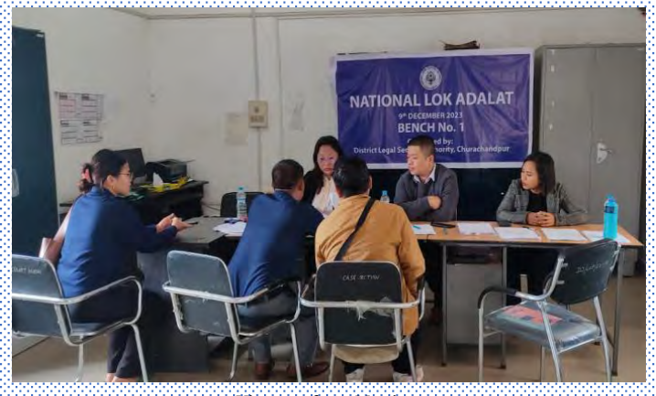
Vignette from Manipur