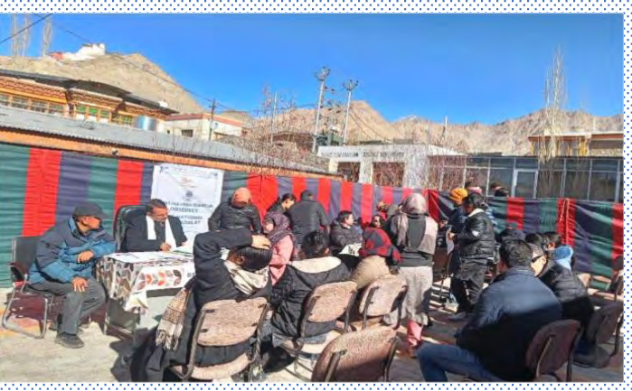
Vignette from Ladakh