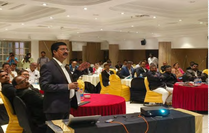
Vignettes from the programme organised by Andhra Pradesh SLSA