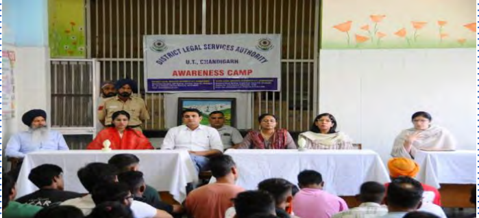
Vignettes from the programme organised by DLSA Chandigarh

On 21.10.2023, DLSA, Thiruvananthapuram, Kerala organised a program at Central Prison and Correction Home, Thiruvananthapuram for the Jail Inmates under the UTRC campaign- 2023. The inmates were extensively counselled and told about the legal provisions for grant of bail, compounding, plea bargaining and remission. The program was inaugurated by the Ld. Member Secretary, Kerala SLSA. The Secretary, DLSA, Thiruvananthapuram alongwith senior Jail Officials were also present.